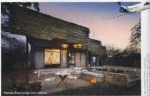
Manse River Lodge, Zimbabwe